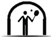
Indoor Sports Halls