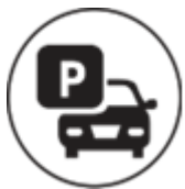
Closed Parking lots